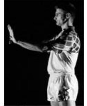
Defenders Back 10M