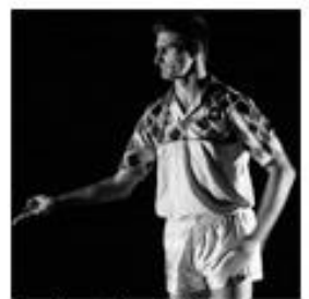
Location of Mark