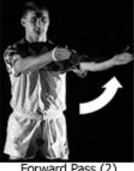
Forward Pass (2)