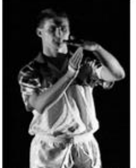
Period Dismissal (1)