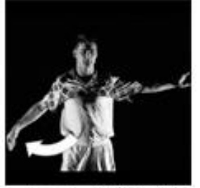
Penalty - Offside (2)