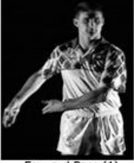
Forward Pass (1)