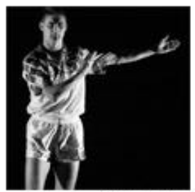
Penalty - Offside (1)