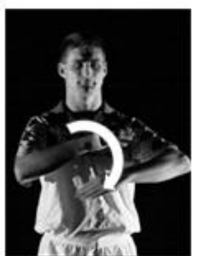
Playing On After Touch