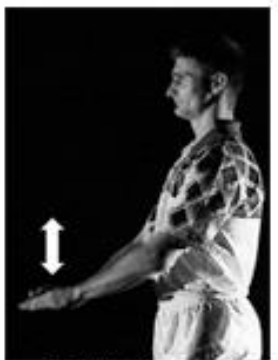
Ball to Ground